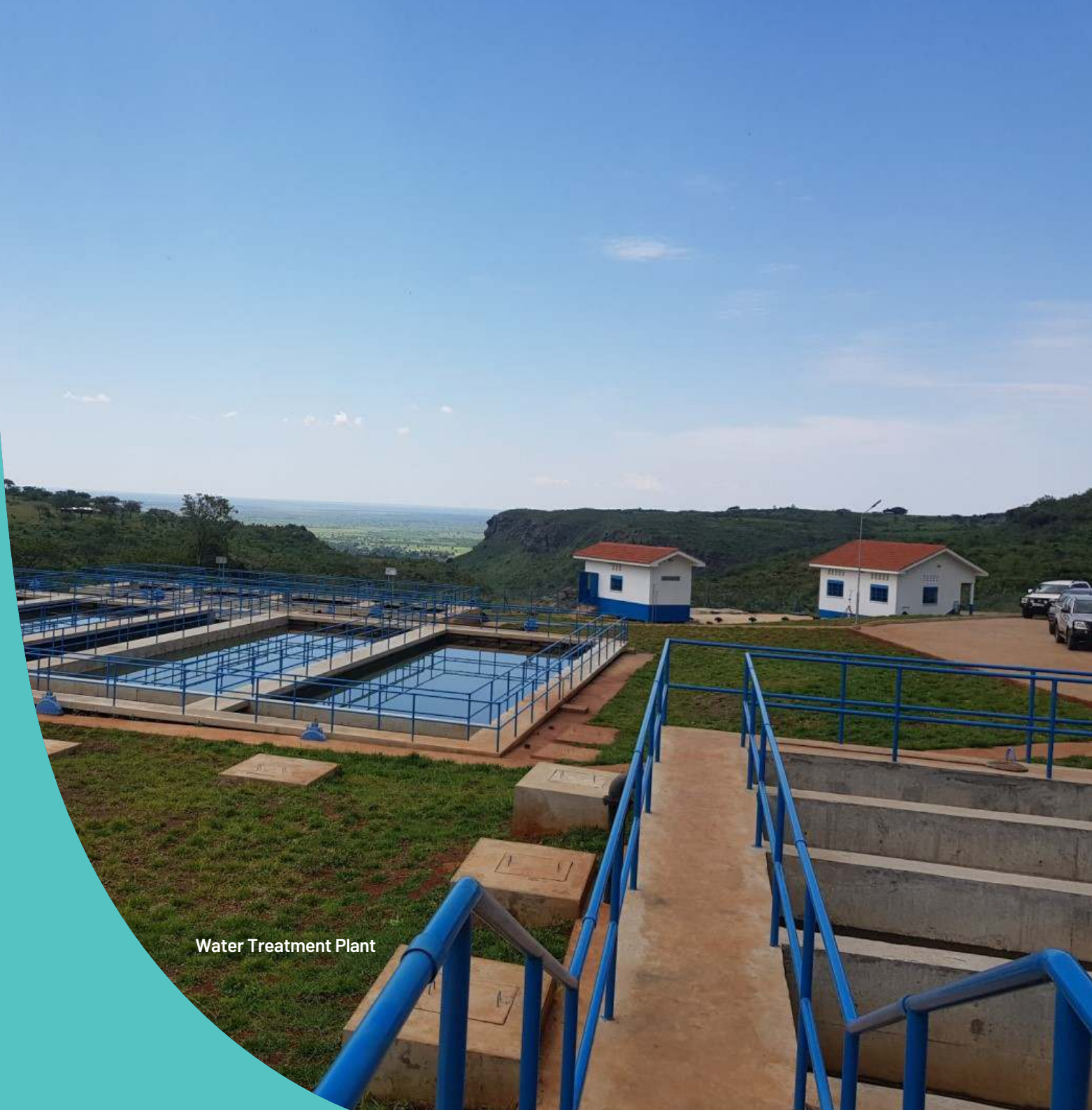
Water Treatment Plant